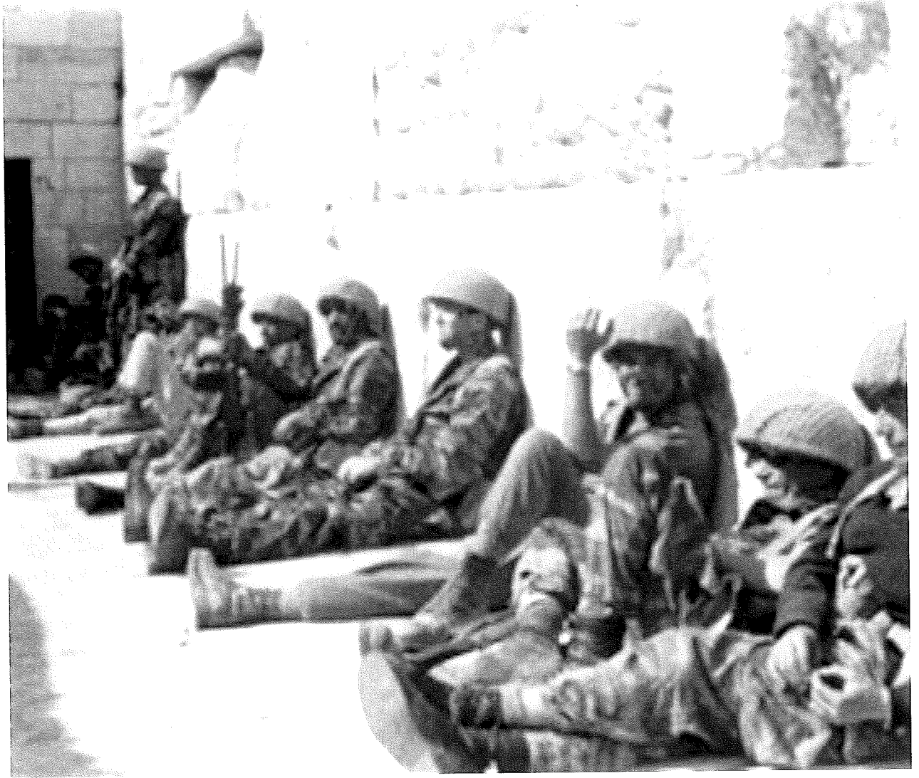
Exhausted Israeli soldiers lean against the Western Wall