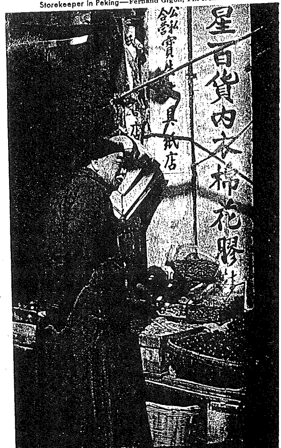
Storekeeper in Peking

Capital: Peking. Official Language: Chinese (Mandarin dialect or Kuo-yü). Official Name: Chung-hua Jen-min Kung-ho Kuo (People's Republic of China). Form of Government: Communist dictatorship; 21 provinces, 5 self-governing regions, 3 cities (Peking, Shanghai, and Tientsin) under direct government control. Head of State—Chairman (four-year term). Area: 3,691,523 square miles. Greatest Distances —(north-south) 2,700 miles; (east-west) 2,600 miles. Coastline —4,019 miles. Elevation: Highest —Mount Everest, 29,028 feet; Lowest —Turfan Depression, 505 feet below sea level. Population: Estimated 1973 Population —801,380,000; distribution, 75 per cent rural, 25 per cent urban; density, 217 persons to the square mile. 1953 Census —582,603,417. Estimated 1978 Population —876,150,000. Chief Products: Agriculture —barley, corn, cotton, goats, hogs, millet, peanuts, rice, sheep, soybeans, sugar, sweet potatoes, tea, tobacco, wheat. Fishing —bass, carp, eels, herring, mackerel, sharks, shrimps. Manufacturing and Processing —cement, chemicals, cotton cloth, iron, lacquer, machine tools, porcelain, silk, steel. Mining —antimony, coal, iron, manganese, salt, tin, tungsten. Forest Products —bamboo, teak, tung oil. National Anthem: "The March of the Volunteers." Money: Basic Unit —yuan (jen-min-piao). Ten chiao equal one yuan. Ten fen equal one chiao. For the value of the yuan in dollars, see MONEY (table). See also YUAN.